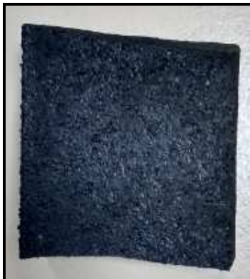
Sample Photograph as in Received Condition

Test Name: Young's modulus from compression Test