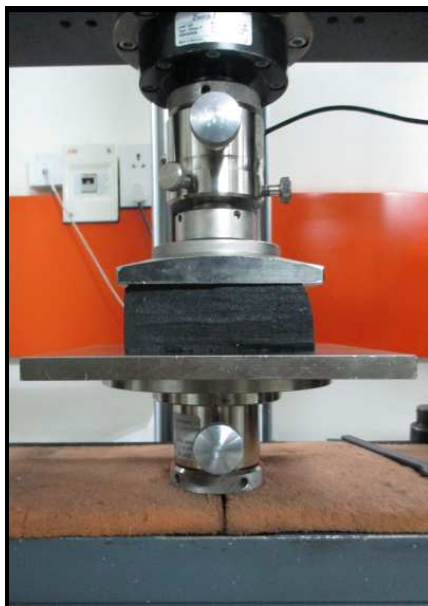
Test Setup Photograph

Test Condition: Lab Environmental condition - 23\pm 2^{\circ}\text{C} , 50\pm 5\%RH Test Speed – 5 mm/min. Pre – Load – 2 N Deflection – 25%