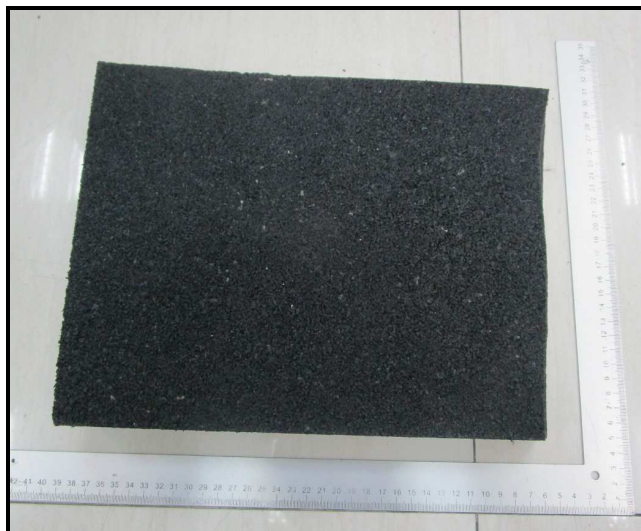
Sample Photograph as in Received Condition